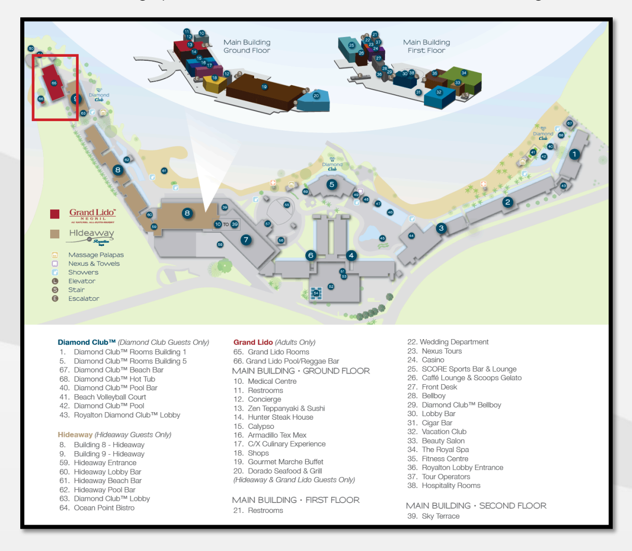
The red outlined portion is the Grand Lido Negril section.

Grand Lido Negril welcomes adults only singles and couples who enjoy nude, topless or clothing optional venues catering specifically to nudists for an all-inclusive resort vacation. Grand Lido Negril is an upscale and tropical property providing the newest addition to clothing optional resort choices on western Jamaica's of Negril.